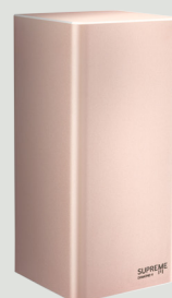
Rose Gold DD50V-RG